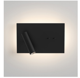
CODE: 1352028 FINISH: MATT BLACK