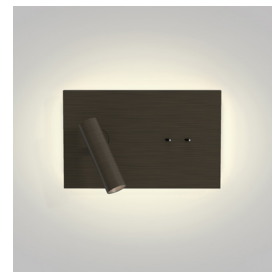
CODE: 1352030 FINISH: BRONZE