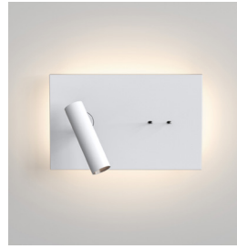
CODE: 1352027 FINISH: MATT WHITE