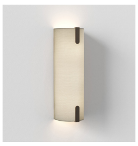
CODE: 1469006 FINISH: PUTTY FABRIC

TO MAINTAIN THIS PRODUCT TO ITS BEST CONDITION, PLEASE VIEW OUR CARE AND CLEANING GUIDELINES ON THE SUPPORT SECTION OF THE ASTRO WEBSITE.