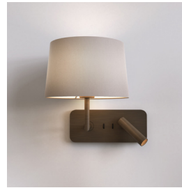
CODE: 1406026 FINISH: BRONZE