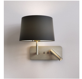
CODE: 1406025 FINISH: MATT NICKEL