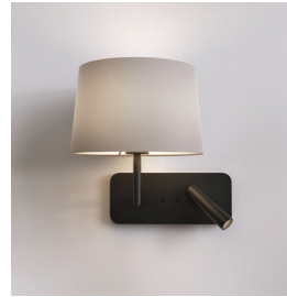
CODE: 1406016 FINISH: MATT BLACK