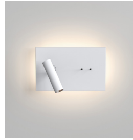
CODE: 1352034 FINISH: MATT WHITE