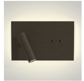
CODE: 1352037 FINISH: BRONZE