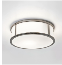
CODE: 1121029 FINISH: POLISHED CHROME